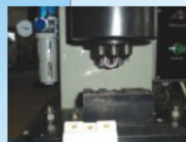
Flaring, Pressing & Trimming machine for Brush Assembly