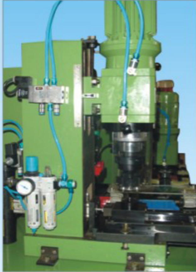
Riveting Machine with Roll Forming Attachment & Pneumatic Sliding Fixture