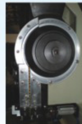
Retention Plate Riveting Machine for Door Latch Assly