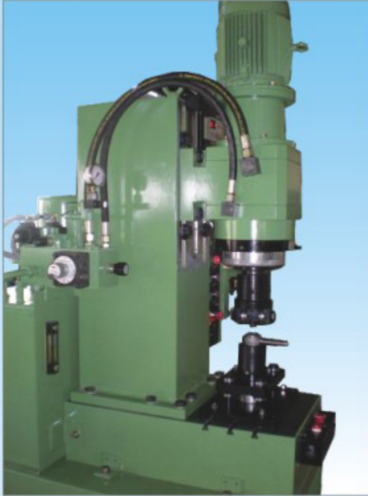
Ball Joint Assembly – roll forming